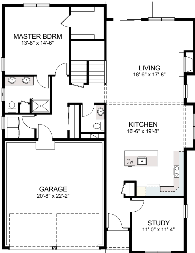
ENTRY LEVEL PLAN